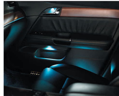
Above: Lear's customizable Ambient Lighting Systems offer specialized lighting effects, including automatic dimming. Bottom left: SoyFoam™ can be used in automotive head restraint, armrest, and seating system cushion foam. Bottom right: Lear's multimedia Rear Seat Entertainment Systems can be seamlessly integrated with the vehicle's interior.